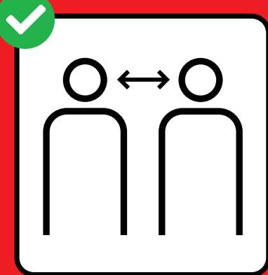
Keep a distance.