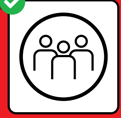
Meet as few people as possible.