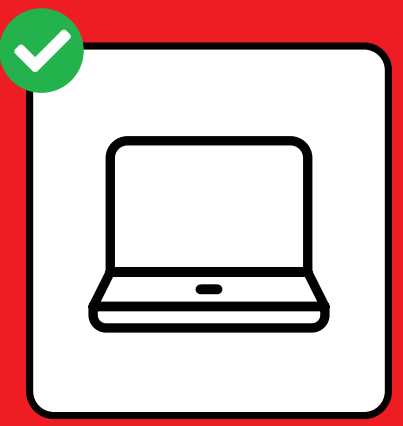
Requirement to work from home where feasible.