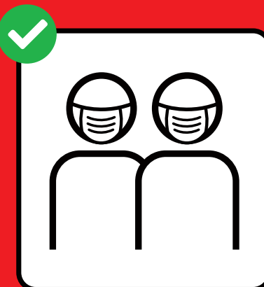
Wear a face mask if it is impossible to maintain that distance.