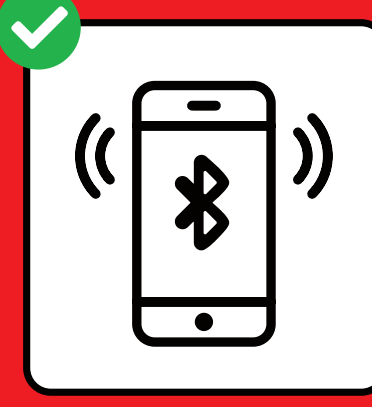
To break infection chains: download and activate the SwissCovid app.