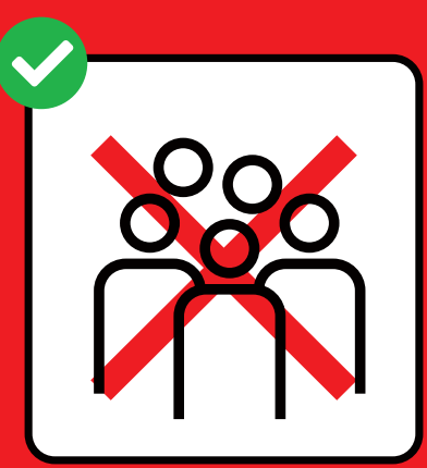
Events Public: banned Private: max. 5 people Gatherings in public, max. 5 people