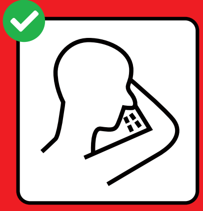
Cough and sneeze into your elbow.