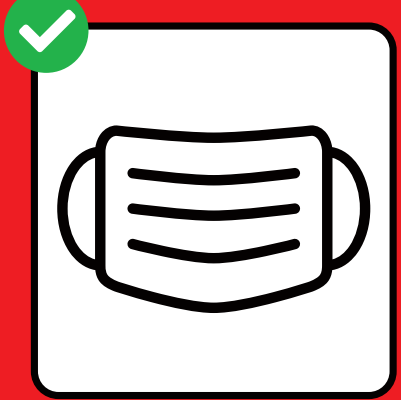
Wearing of masks compulsory in public spaces, on public transport and at the workplace.