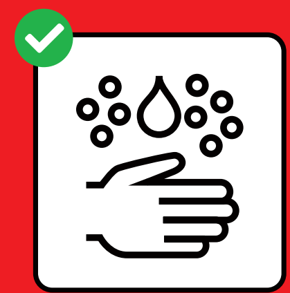
Wash your hands thoroughly.