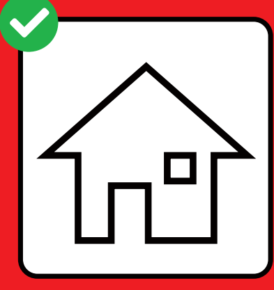
If you test positive: isolate. If you have had contact with a confirmed case: quarantine.