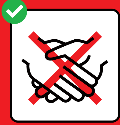
Do not shake hands.